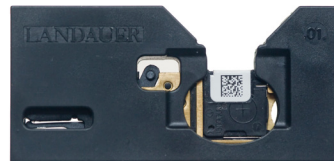
nanoDot carriers slide in and out of the adapter (2D bar code facing front) for read-out in a microStar reader.

nanoDots are the most effective tool to comply with existing or emerging patient dose monitoring regulations, and provide an inexpensive insurance policy to mitigate litigation risk for your facility.